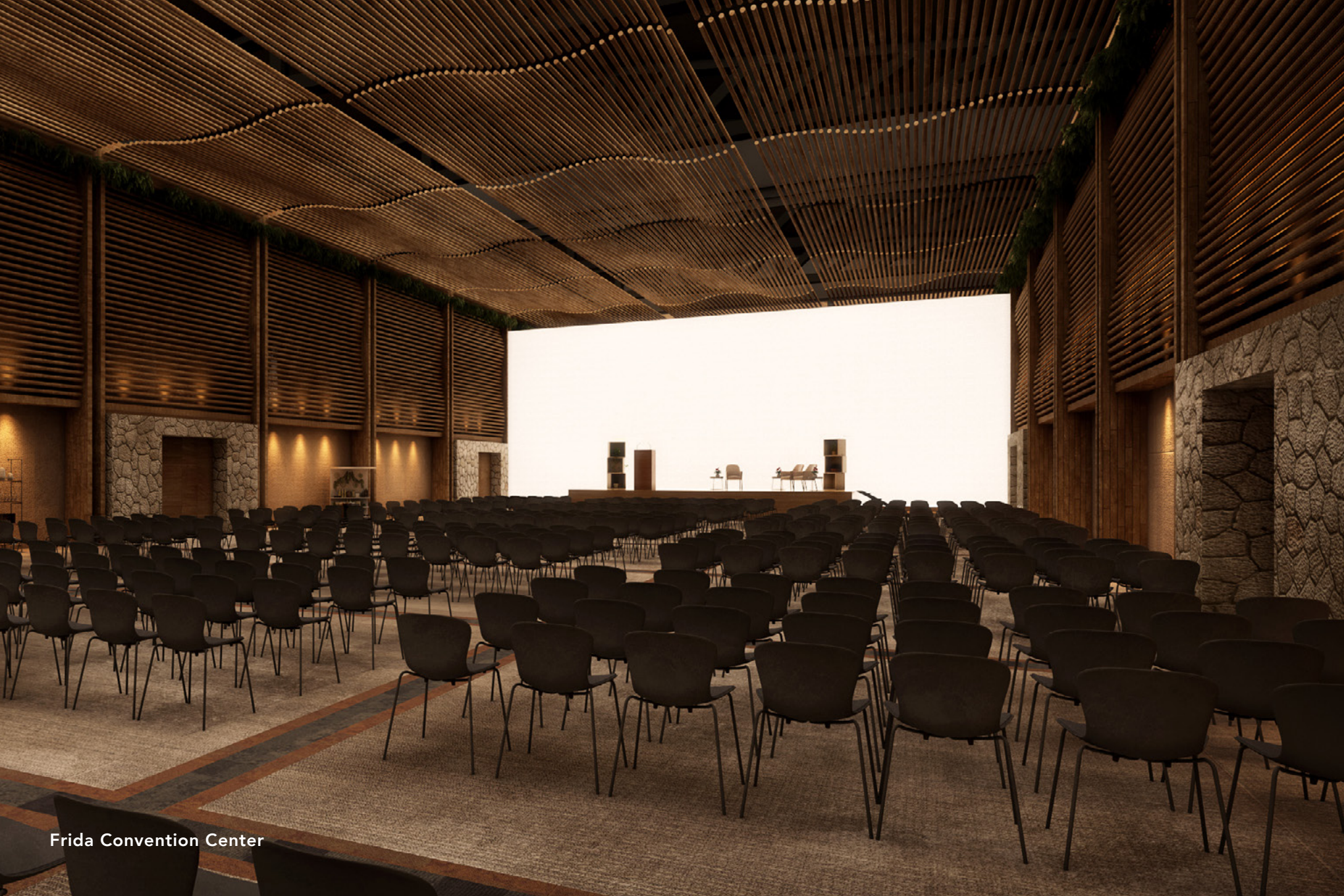
Frida Convention Center