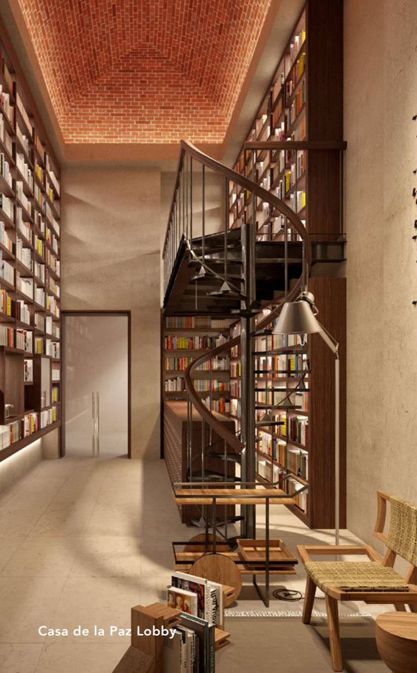
Casa de la Paz Lobby