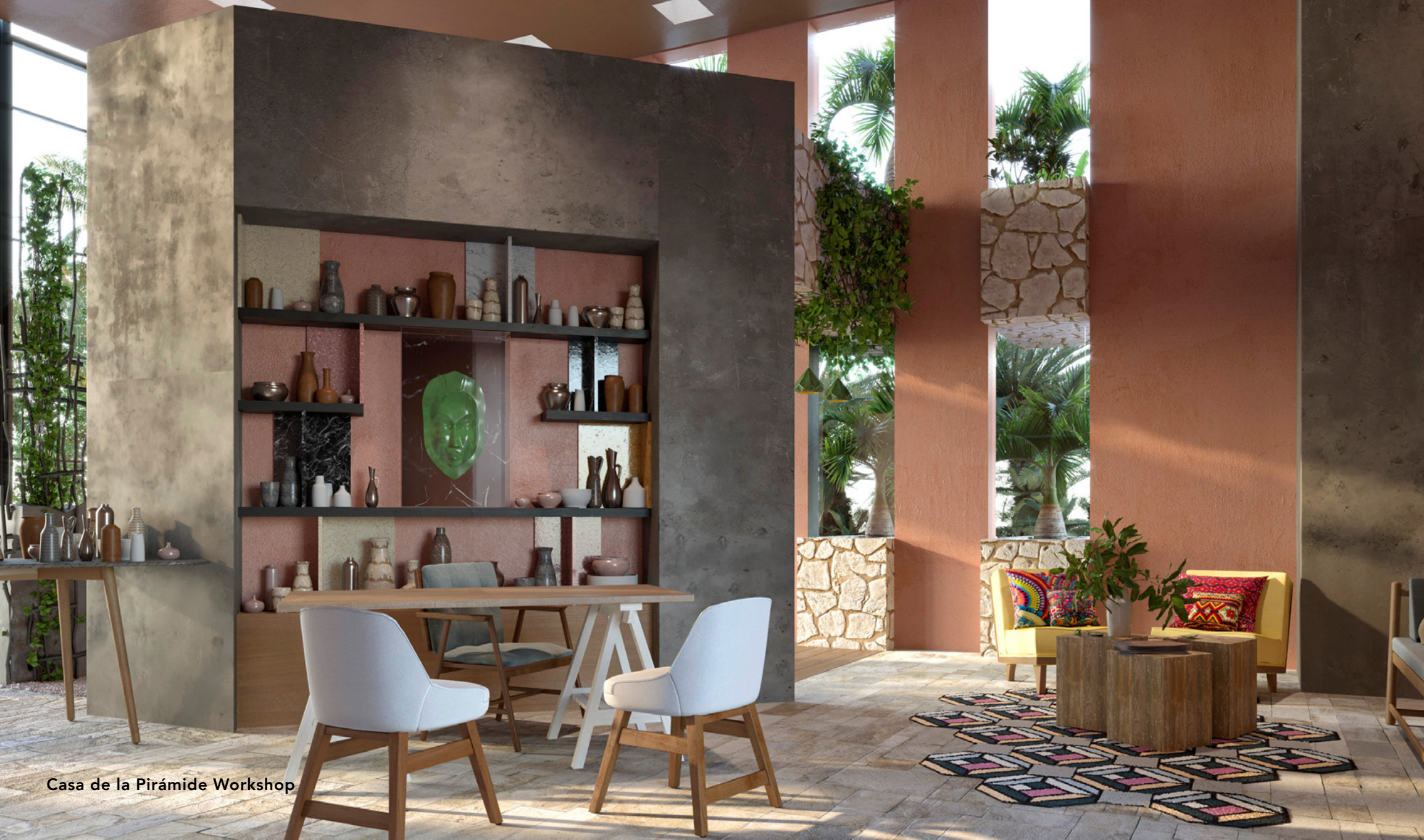
Casa de la Pirámide Workshop