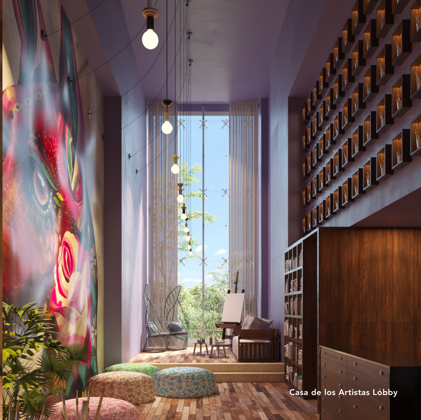
Casa de los Artistas Lobby