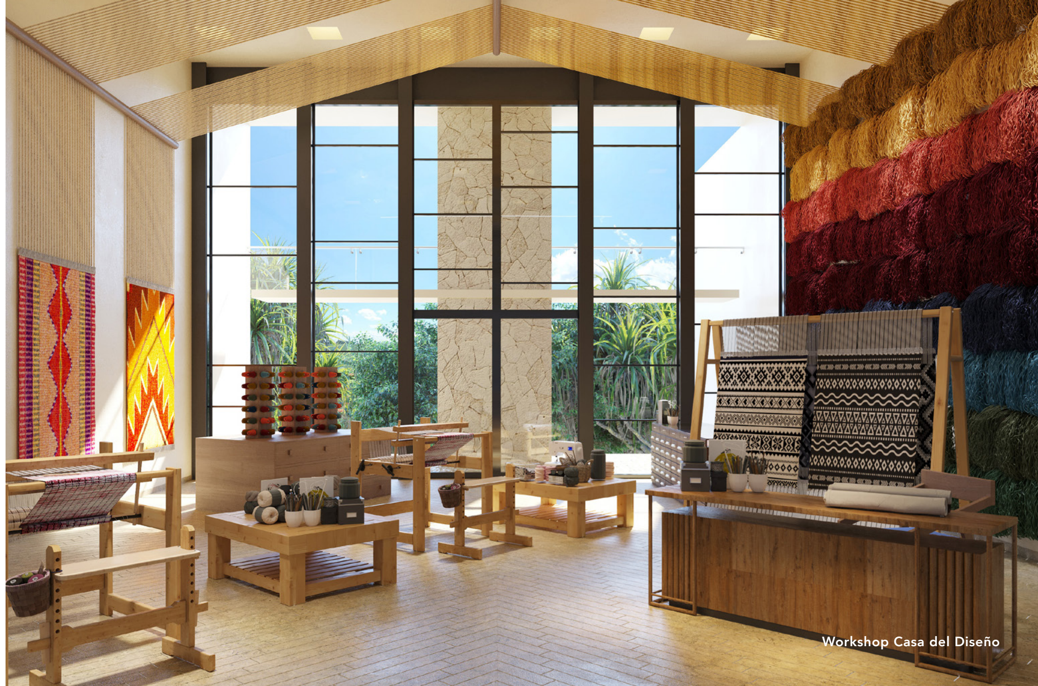
Workshop Casa del Diseño

We believe in being a part of the essence, generating experiences in an environment of true astonishment, and magical trips that allow us to experience the art from its origins.