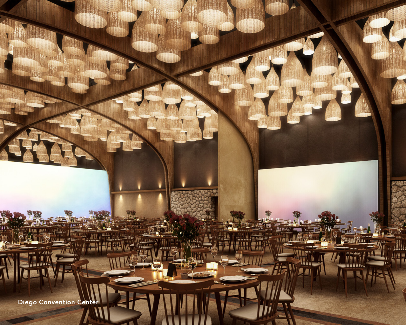
Diego Convention Center