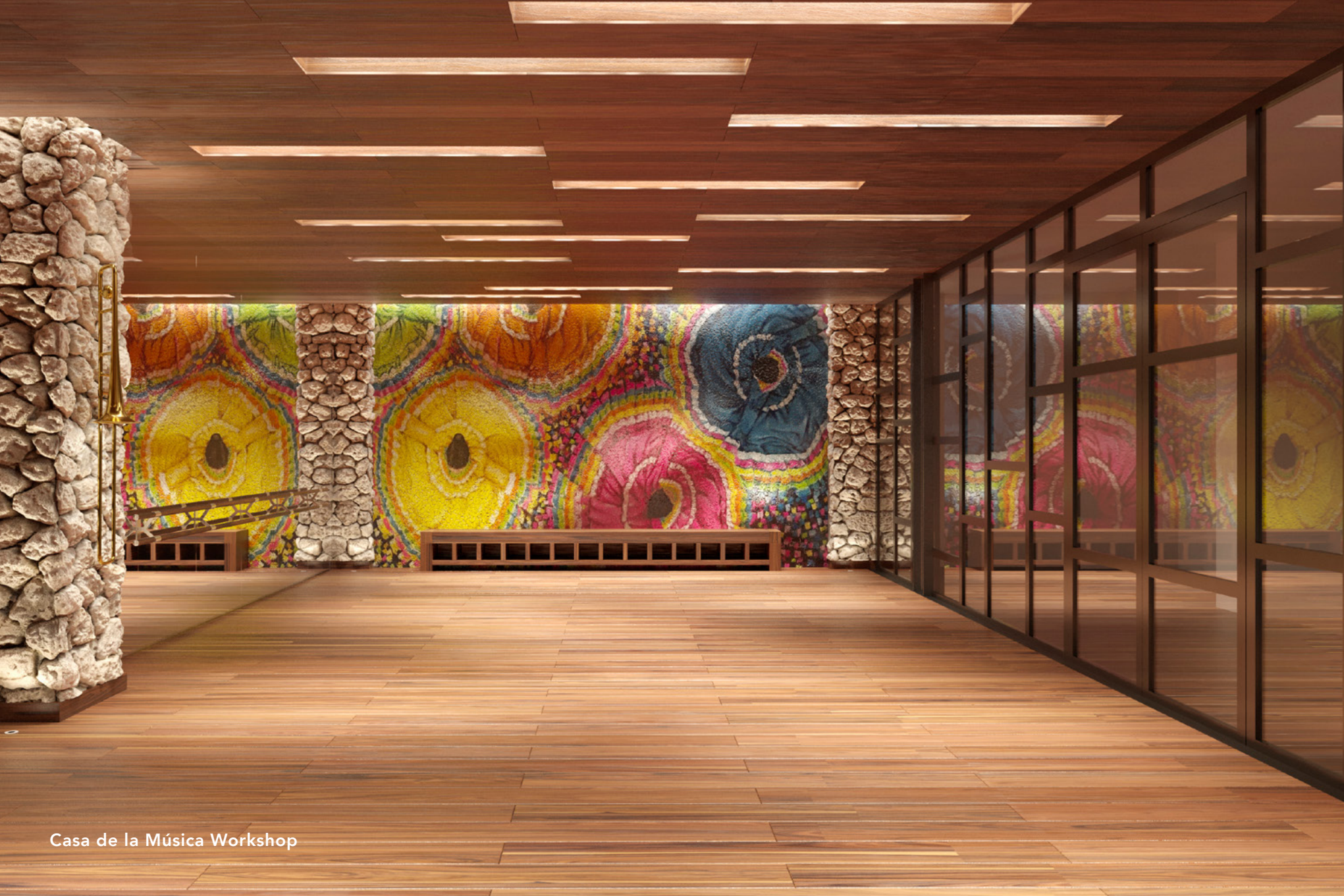
Casa de la Música Workshop