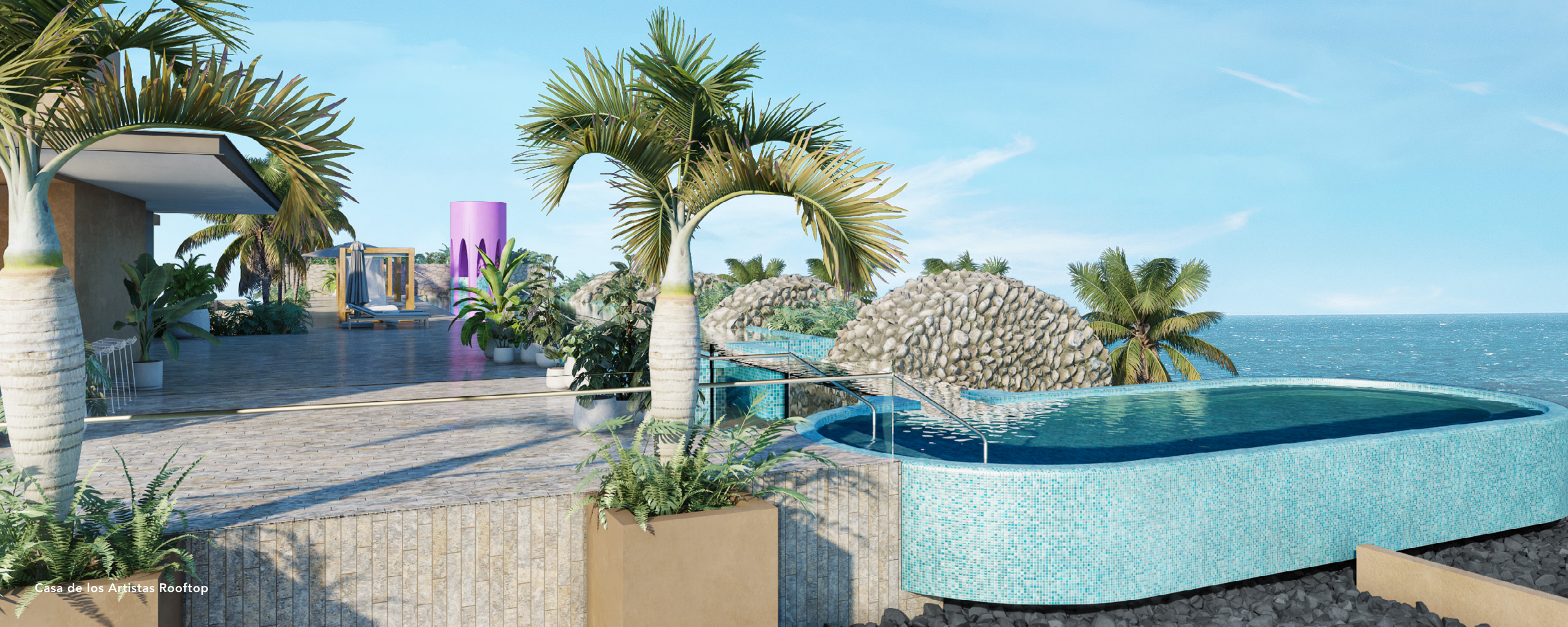
Casa de los Artistas Rooftop