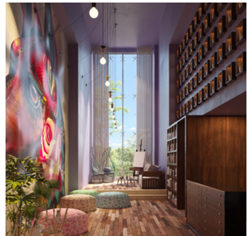
Casa de los Artistas Lobby